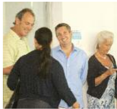
Junior School parents at the Leaders' Induction Service