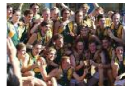
The victorious U19 team