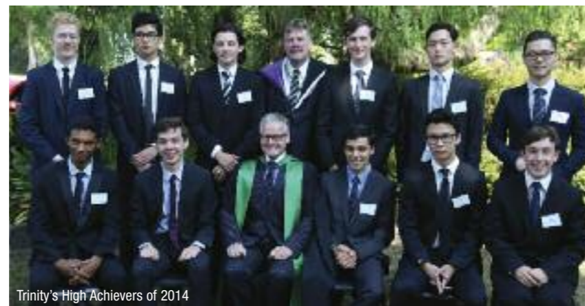
Trinity's High Achievers of 2014