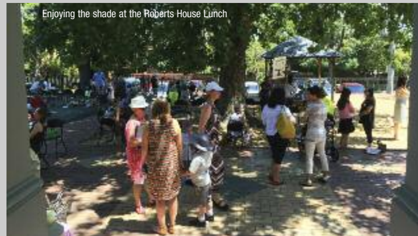
Enjoying the shade at the Roberts House Lunch