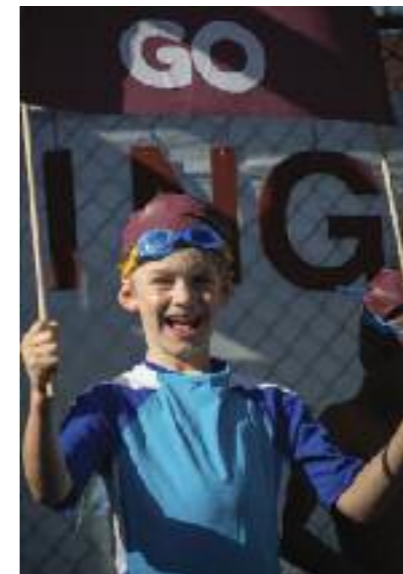
The boys love to cheer for their Houses at House Swimming