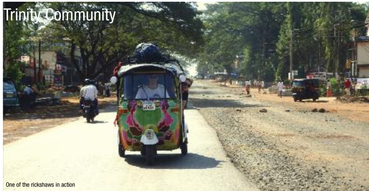
One of the rickshaws in action