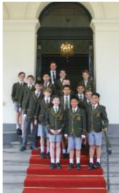
St Paul's Choir

The St Paul's Choristers sang at two very special services: at Government House and at St Paul's Cathedral for the opening of Parliament and the Law Courts.