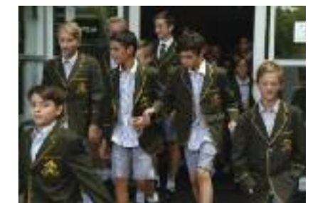
Year 7 students on their first day