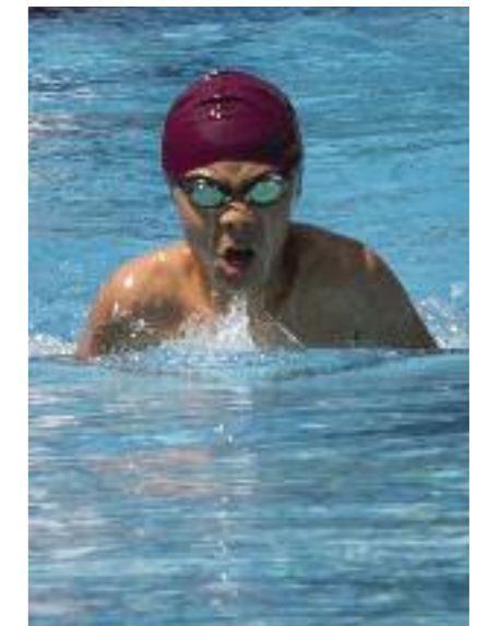
The weather was perfect for House Swimming