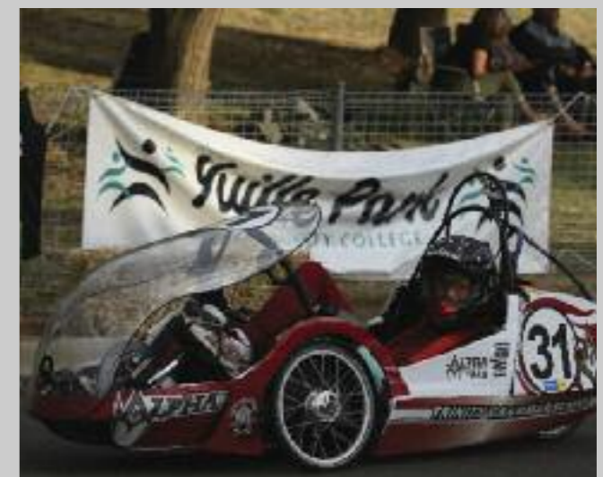
Pedal power rules on the track

The boys' enjoyment of this event was enhanced considerably by the outstanding support provided by parents. Their commitment and dedication to this program was extraordinary, from sponsorship (thanks to Jaylec Automotive Electrical and Peter Stevens Motorcycles), to preparation, and to the logistics of the event itself.