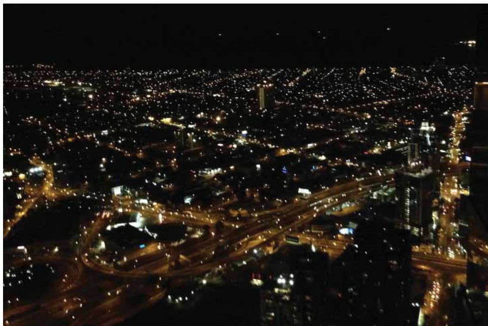
View taken from the Eureka Tower

The next stop was Melbourne Central Tower, the tallest tower in Australia. The night was not very cold, the wind brushed on our faces, relaxing, comfortable. On the eighty-eighth floor which is the top of the whole building, outside the glass, yellow twinkling streetlights lit up Melbourne's evening, a lengthy winding coastline separated the high buildings and the sea. It was quite a view! Especially when we got out to the edge, standing on lucid glass, the cars under our feet were just like insects running rapidly. What a wonderful night!