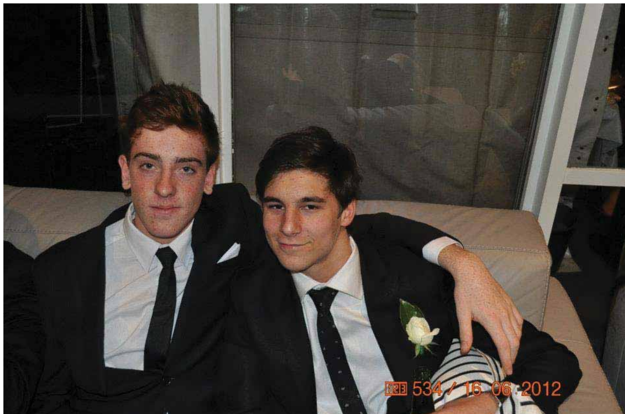
Dane at the Formal