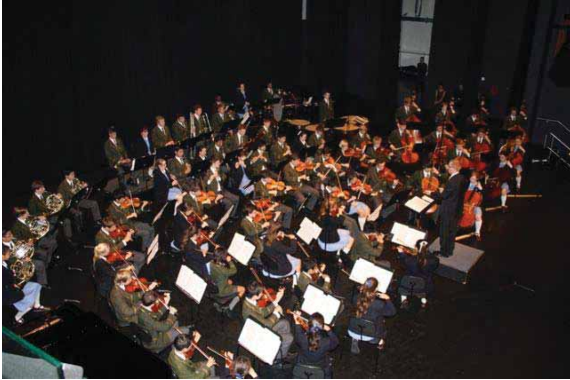
Combined Trinity/Ruyton Orchestra