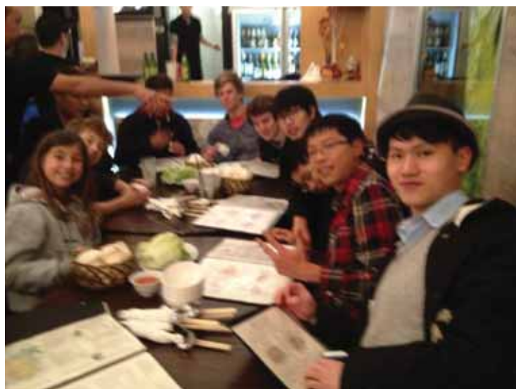
Boarding House dinner at Viet Star

Now let me take you to 5.00pm on the 25 th May.