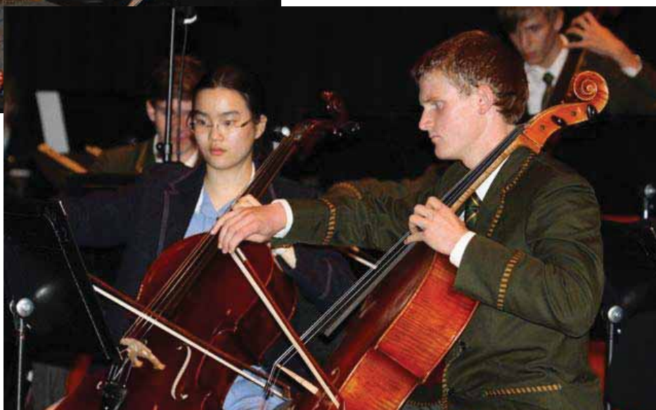
Combined Trinity/Ruyton Orchestra