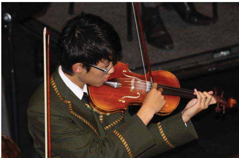
Combined Trinity/Ruyton Orchestra