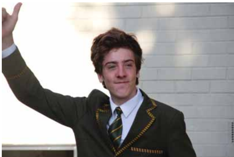
Dane practicing the victory wave

the allegiance of our more skeptical International Boarders.